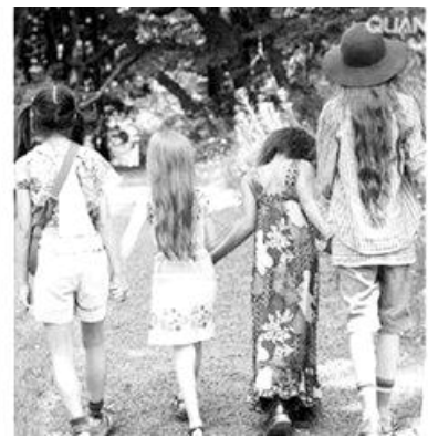
A B C