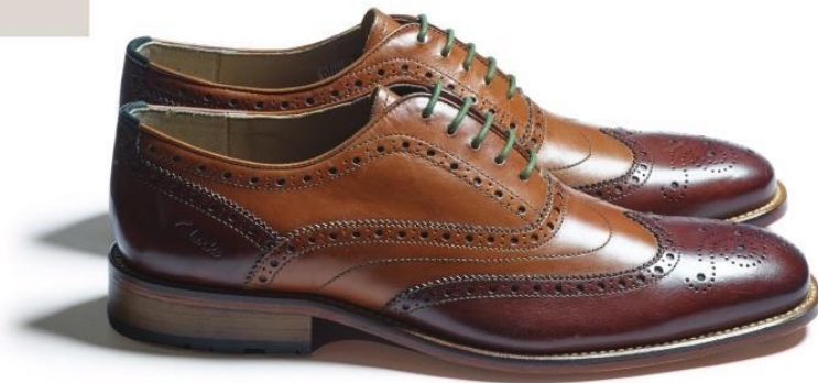
PENTON LIMIT Tan combi, Black combi, Black leather, Dark blue leather